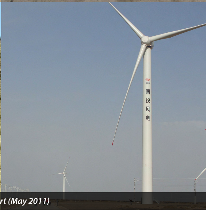
Ningxia desert (May 2011)