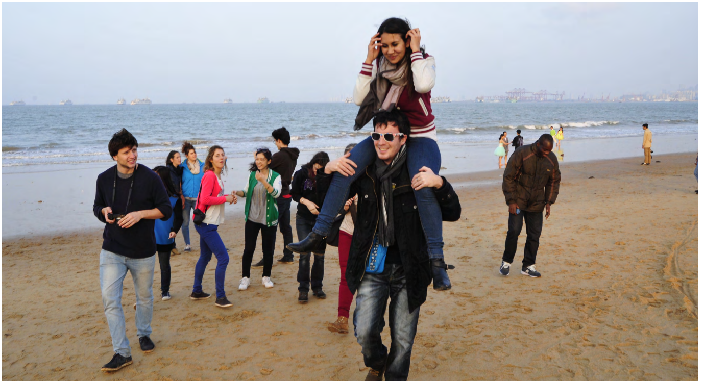
Hainan Island (December 2014), the very southern chinese island a few days of warm weather in the midst of winter