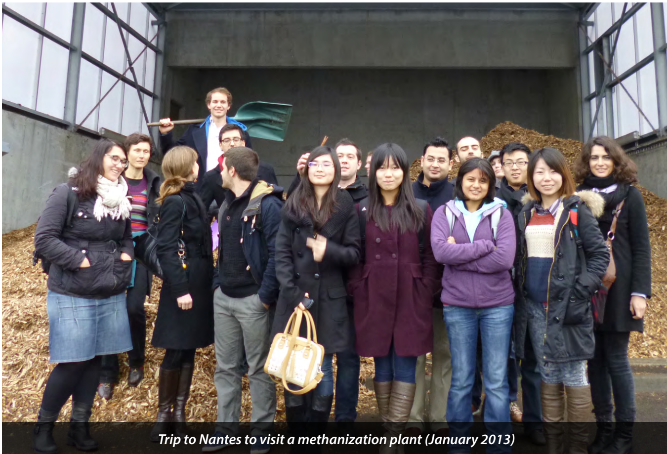
Trip to Nantes to visit a methanization plant (January 2013)