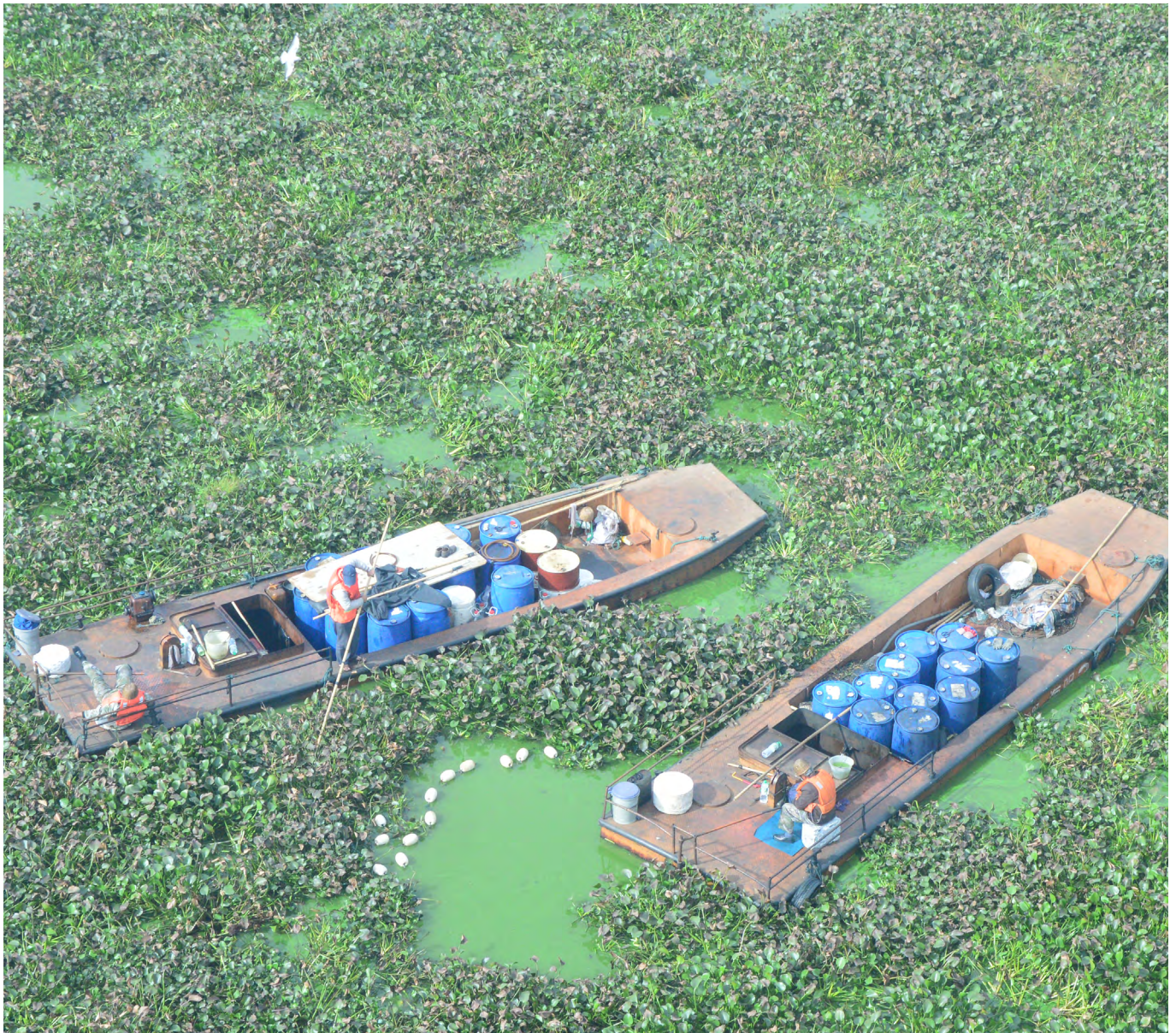
Two flat boats in Hyacinths, Dianchi Lake (May 2014). Purple rooted hyacinth sequestering large amounts of nitrogen and phosphorous pollutants, are harvested from the lake, dried, and turned into fertilizer or animal feed.