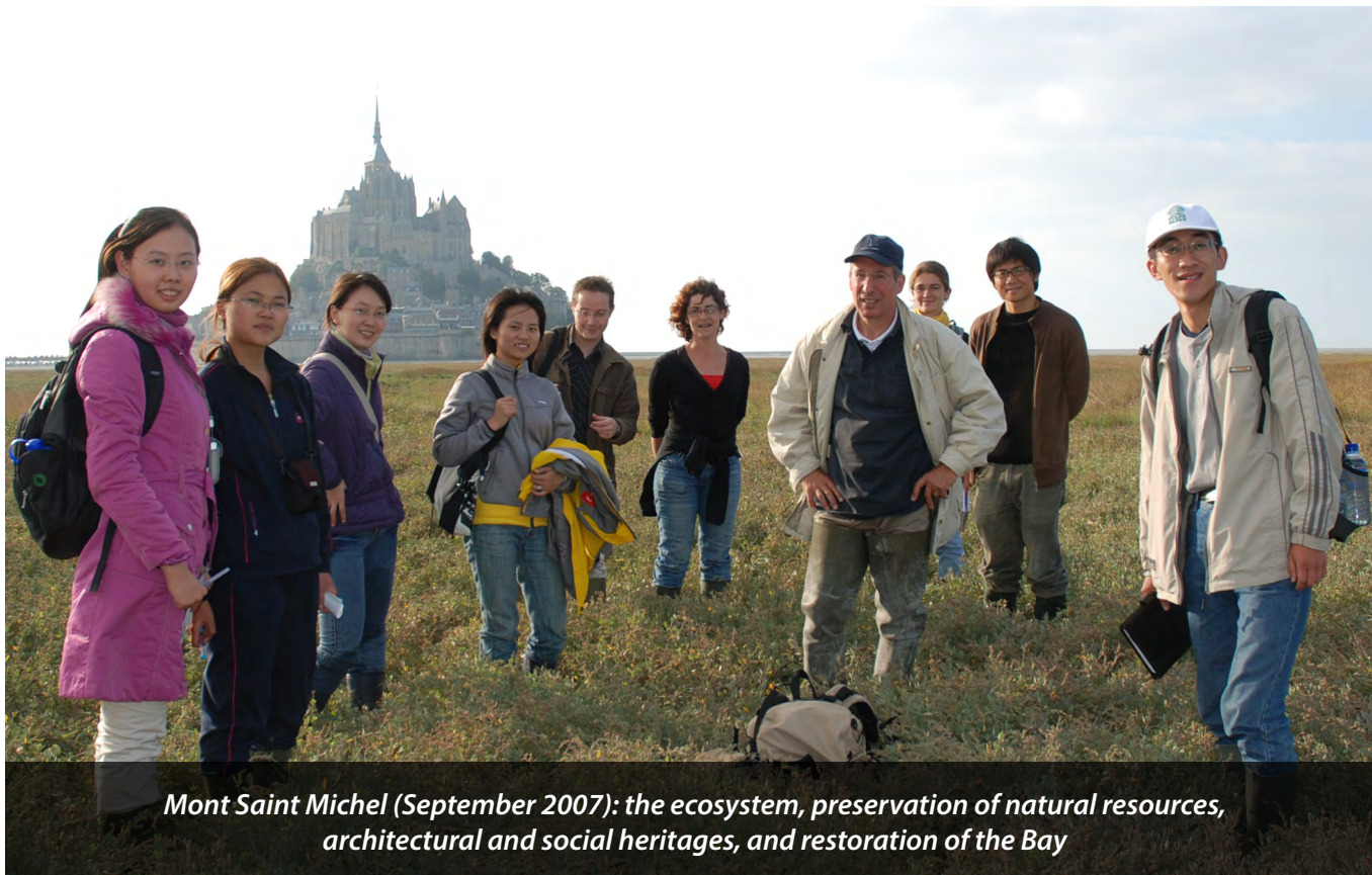
Mont Saint Michel (September 2007): the ecosystem, preservation of natural resources, architectural and social heritages, and restoration of the Bay