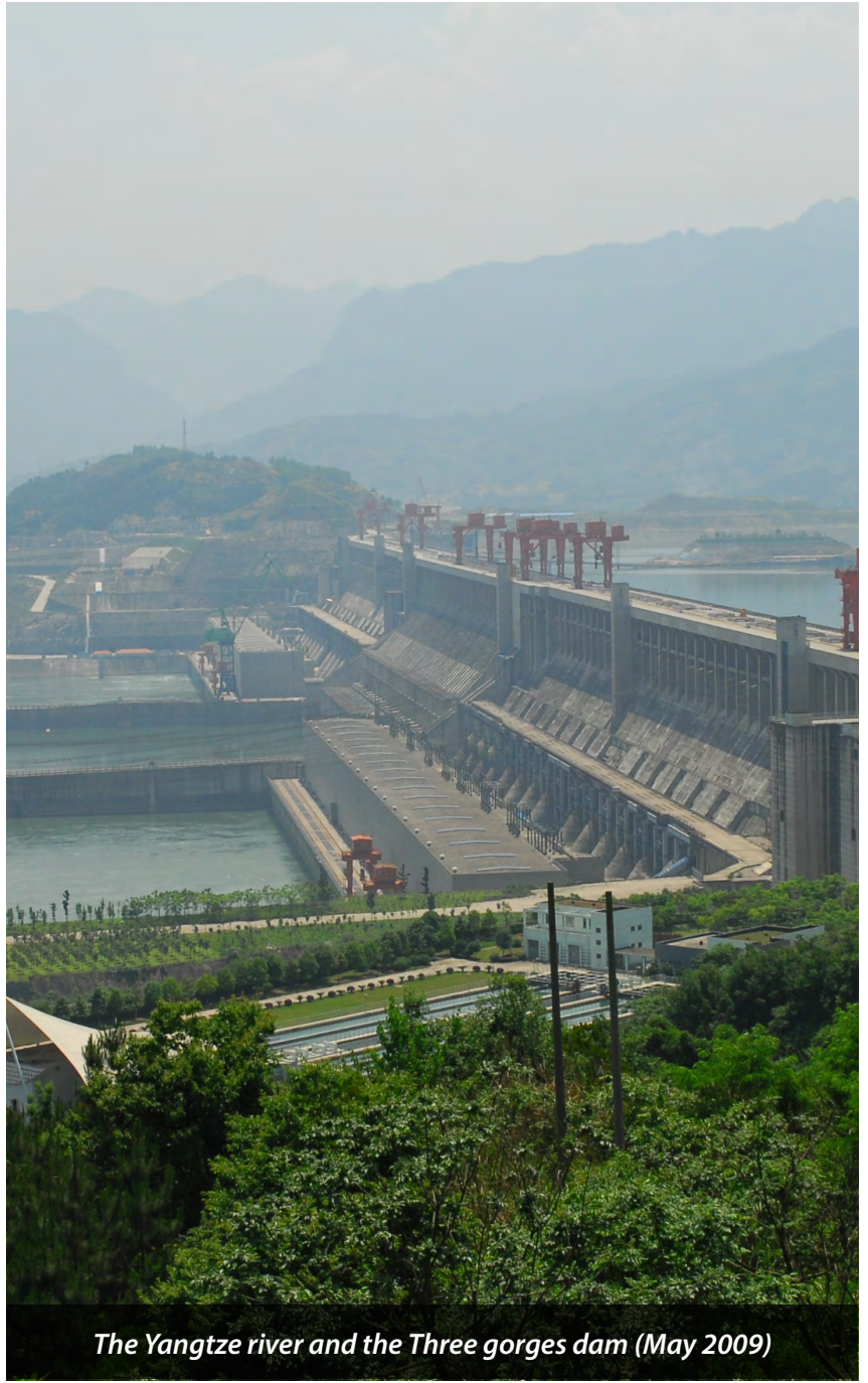
The Yangtze river and the Three gorges dam (May 2009)