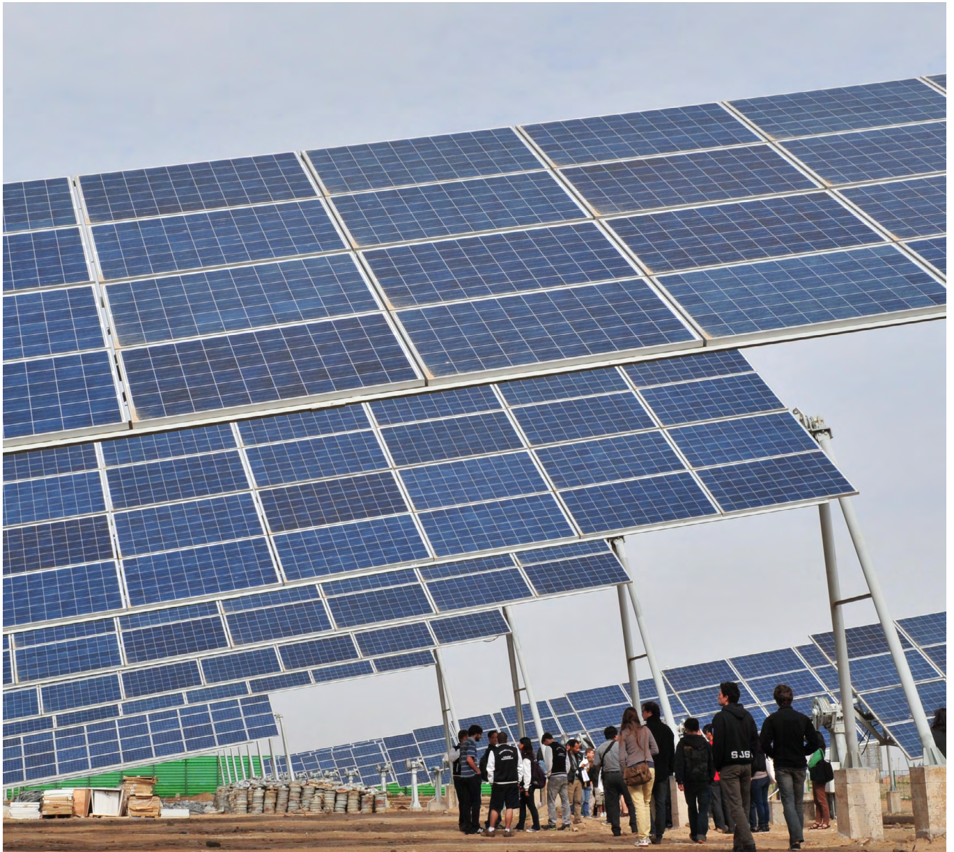
A PV solar farm in the middle of a remote place (May 2012) Ningxia suffers of land desertification, through water erosion, wind erosion, dryness and evaporation, but holds large coal resources and has enormous solar and wind power potential.