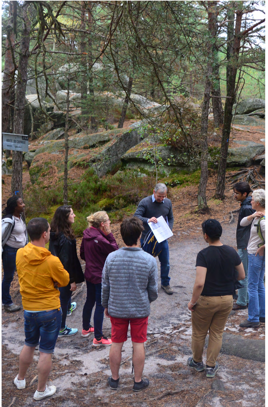
Visit of the Forêt de Fontainebleau (September 2016)