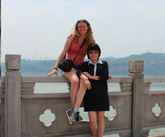
Mountain Forest park of Kunming (May 2013), on the shore of the Dian Lake, renowned for its numerous historic sites from the Yuan Dynasty and with a wonderful view over the lake.