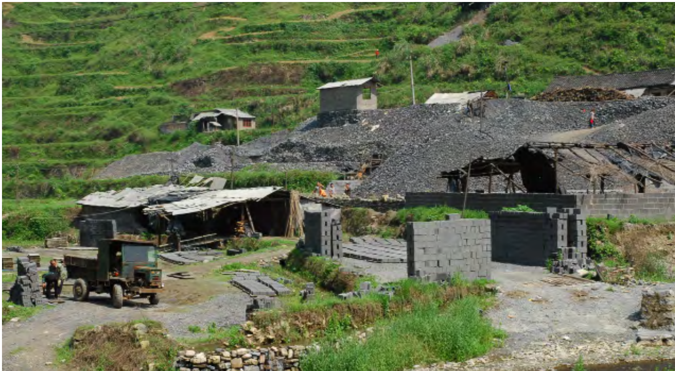
Guizhou province (May 2008) : environmental impacts from old cinnabar mining for mercury production to local economic development