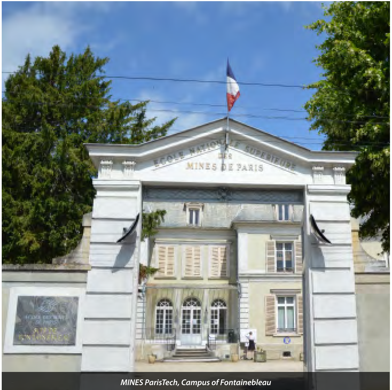
MINES ParisTech, Campus of Fontainebleau