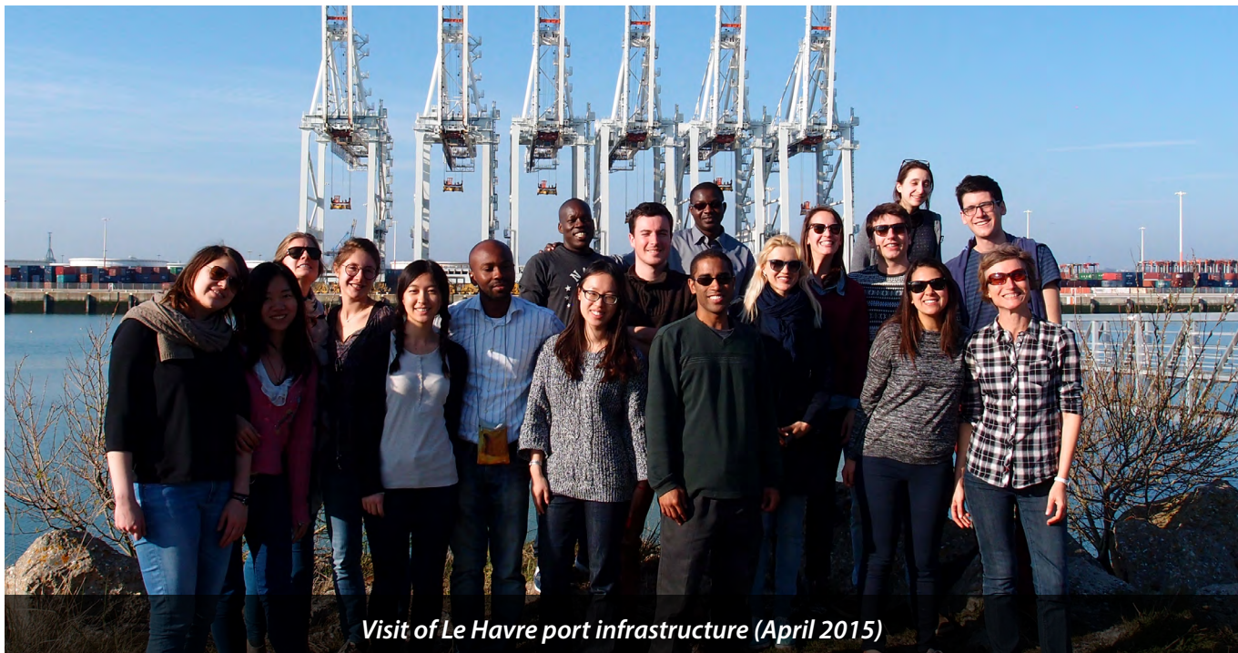
Visit of Le Havre port infrastructure (April 2015)

Greening Industrial park through the concepts of Circular Economy Project, from TEDA, one of the first Chinese EIPs close to Tianjin, to the Grand Port du Havre... a unique experience of team work