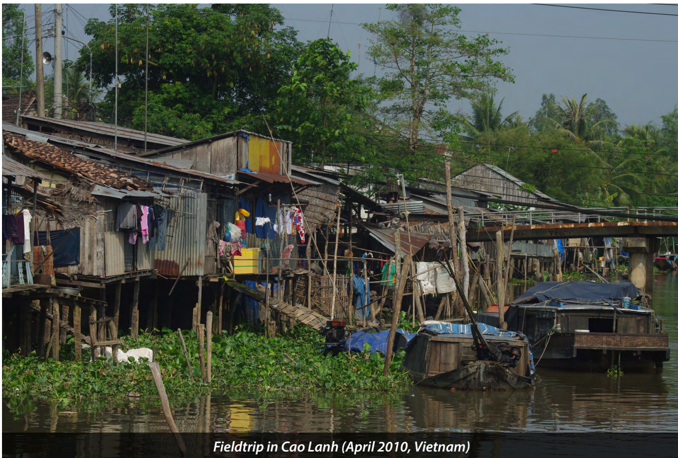
Fieldtrip in Cao Lanh (April 2010, Vietnam)

Cao Lanh (April 2010) : This new Vietnamese city of 170,000 inhabitants, administrative centre of the Dong That province, located in the Mekong Delta, has exceptional natural resources: soil fertility for rice growing and the presence of the Mekong for fish breeding. The Vietnamese authorities wish to develop the city economically; a strong population growth is expected by 2020. However, the location of Cao Lanh makes it very vulnerable in terms of climate change, onto which are superimposed the problems related to agricultural intensification. This workshop enabled students to discover and study the issues related to urban development in an ecosystem which is both sensitive and strategic as far as food production and consumption are concerned.